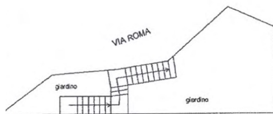
PIANO 2° SOTTOSTRADA h= 2,95m